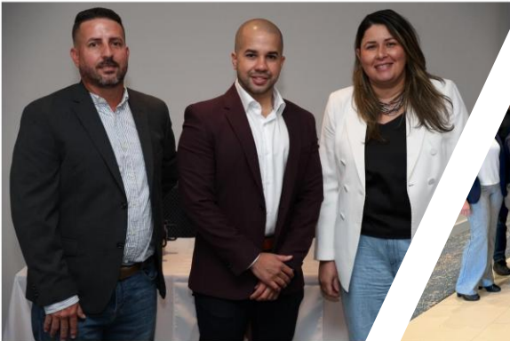
Tarde de Premios y Reconocimiento Comité de Salud y Seguridad Ocupacional